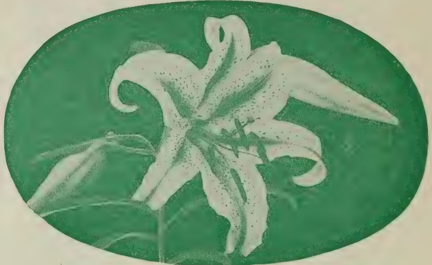
Lilium Auratum (one-fifth natural size).